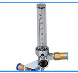
✤Nitrogen valve (Model: HN2-01)

Data logging humidity and temperature, can read and output data by software with a PC