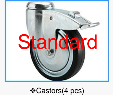
To move the cabinet on floor easily

Effective usage of N_2 combined with Super Dry, help to accelerate the recovery time and oxidation prevention. Set on digital control panel