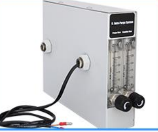
Nitrogen auto purge system (Model AN2-03)

Simple N<sub>2</sub> flow meter 0-25L/min adjustable