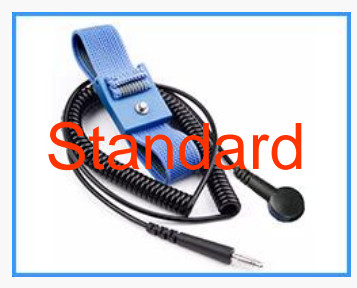
♦Wrist strap connection

Alarm light flashes and sounds when its internal humidity exceeds set value