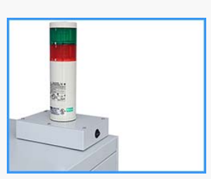
❖Humidity alarm light

Greatly increase the usable space inside Super Dry